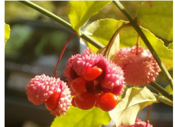
Hearts-a-bustin' with love